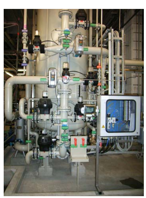
Mixed bed for polishing